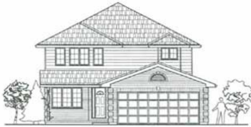
FRONT ELEVATION OPTION "B"