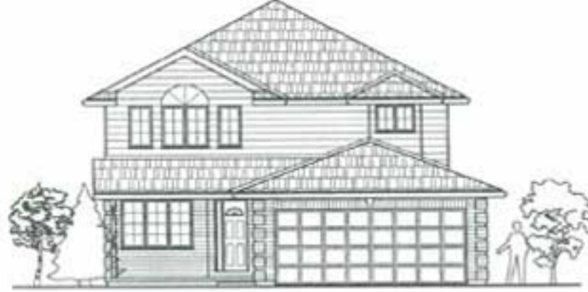
FRONT ELEVATION OPTION "A"