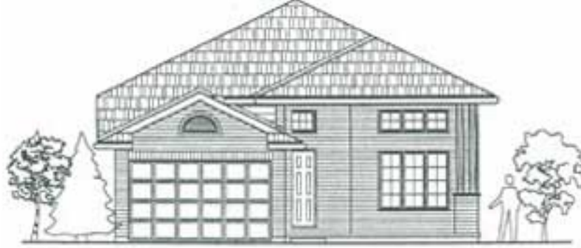
FRONT ELEVATION - OPTION A