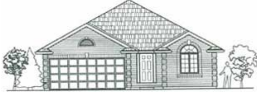
FRONT ELEVATION - OPTION A