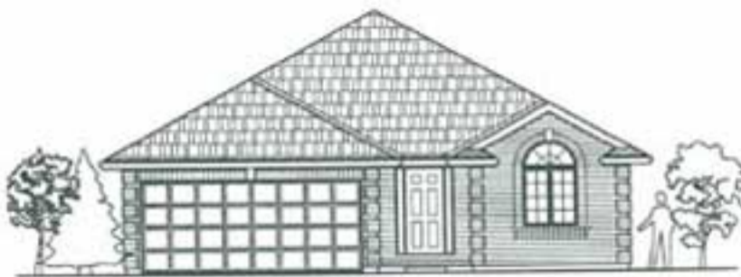
FRONT ELEVATION - OPTION B