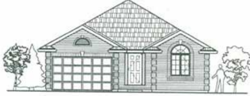
FRONT ELEVATION - OPTION A