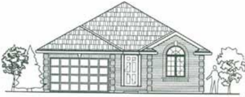
FRONT ELEVATION - OPTION B