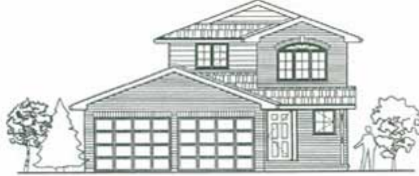
FRONT ELEVATION - OPTION A