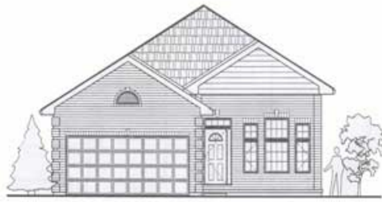
FRONT ELEVATION OPTION "A"