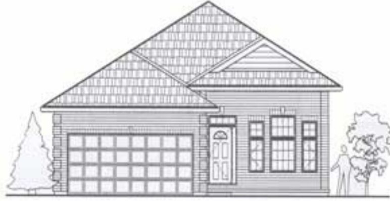
FRONT ELEVATION OPTION "B"