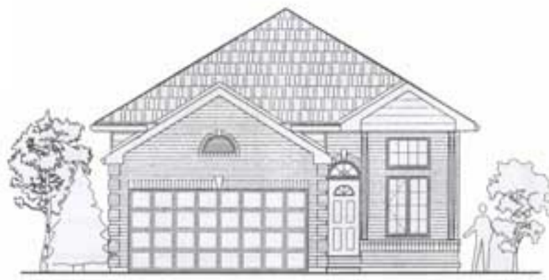
FRONT ELEVATION OPTION "A"