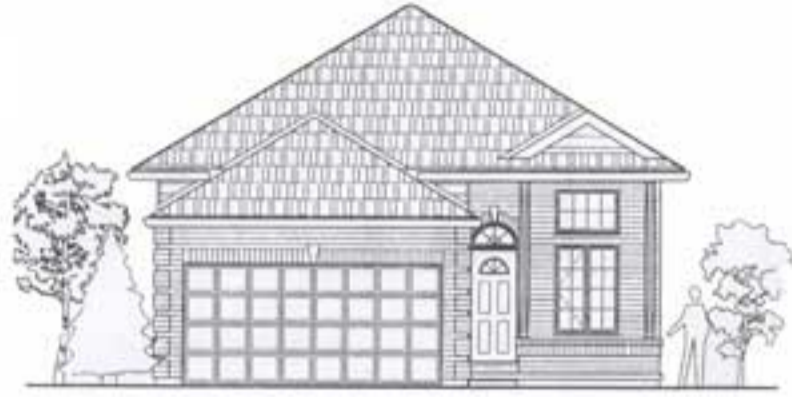
FRONT ELEVATION OPTION "B"