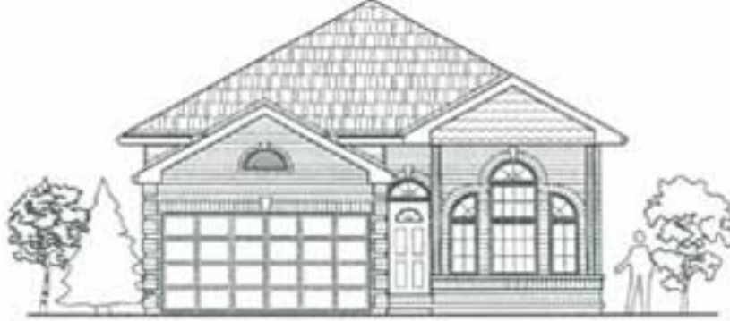
FRONT ELEVATION - OPTION A