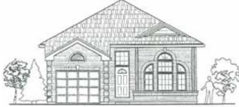
FRONT ELEVATION - OPTION A