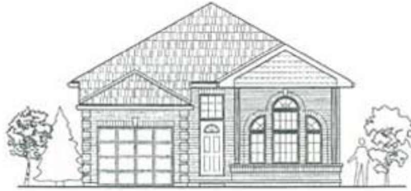
FRONT ELEVATION - OPTION B