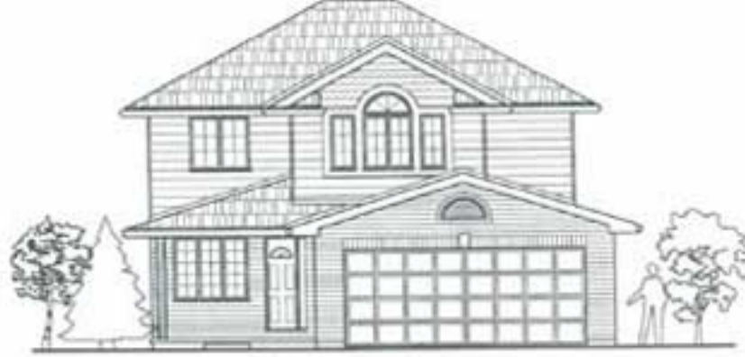
FRONT ELEVATION OPTION "A"