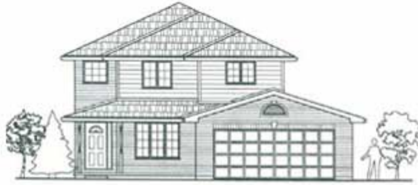
FRONT ELEVATION OPTION "B"