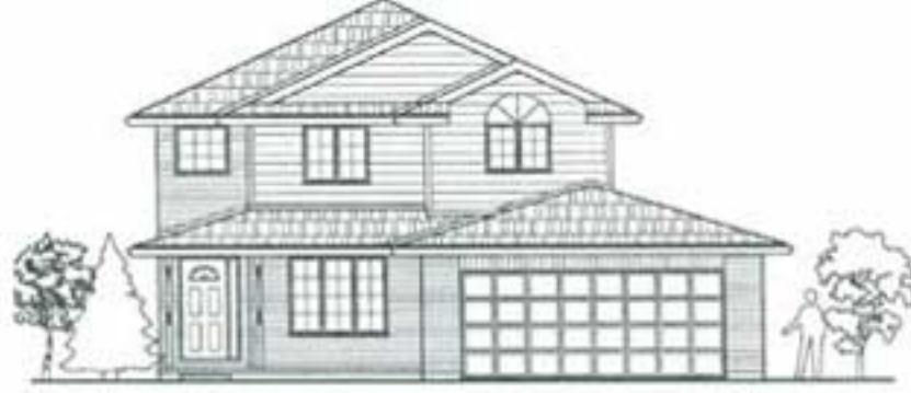
FRONT ELEVATION OPTION "A"